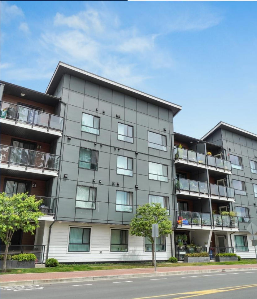
2699 Peatt Road, Langford, BC

The Fund expects to pay monthly distributions of not less than 3.1% on an annualized basis on each of its outstanding Unit classes. The following is a summary of the monthly distribution amounts for each outstanding Unit class.