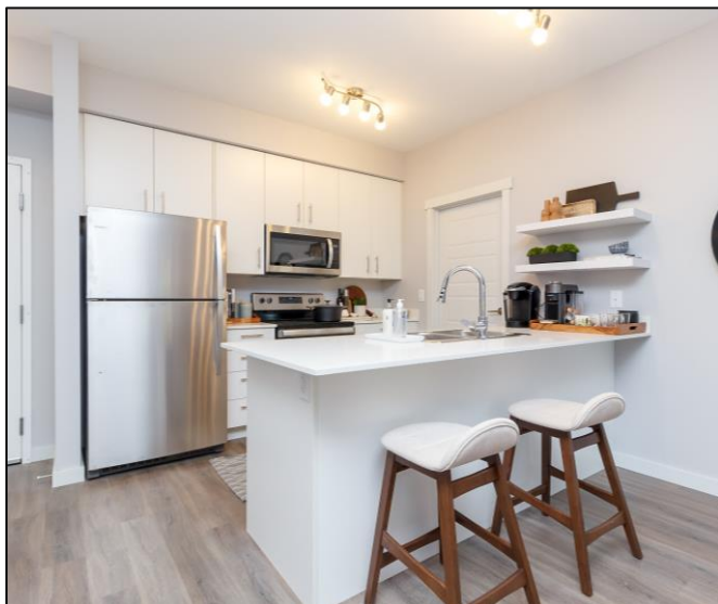
Kitchen & Living Area