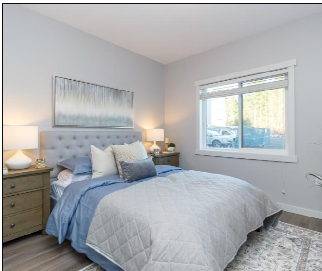
Bedroom & Ensuite