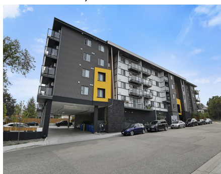
1803 31A Street Vernon, British Columbia