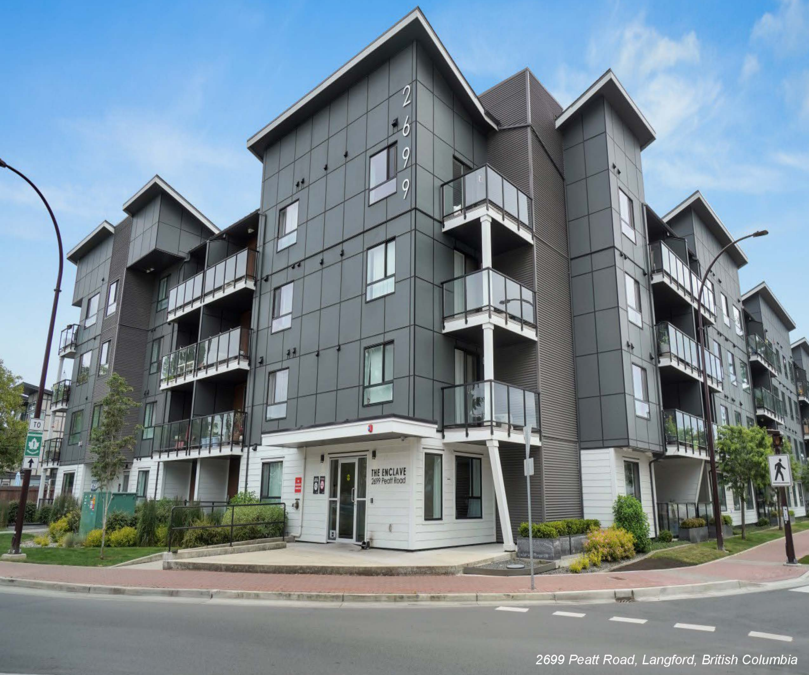
2699 Peatt Road, Langford, British Columbia